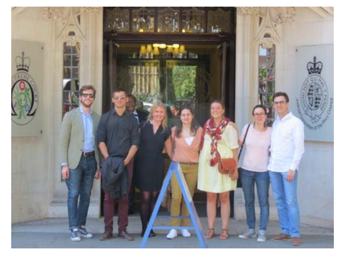
Alliuris Summer School in London