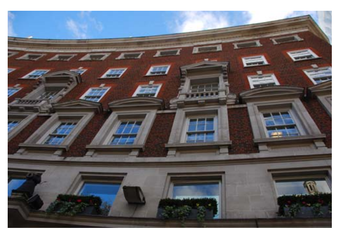
Office Kerman & Co.