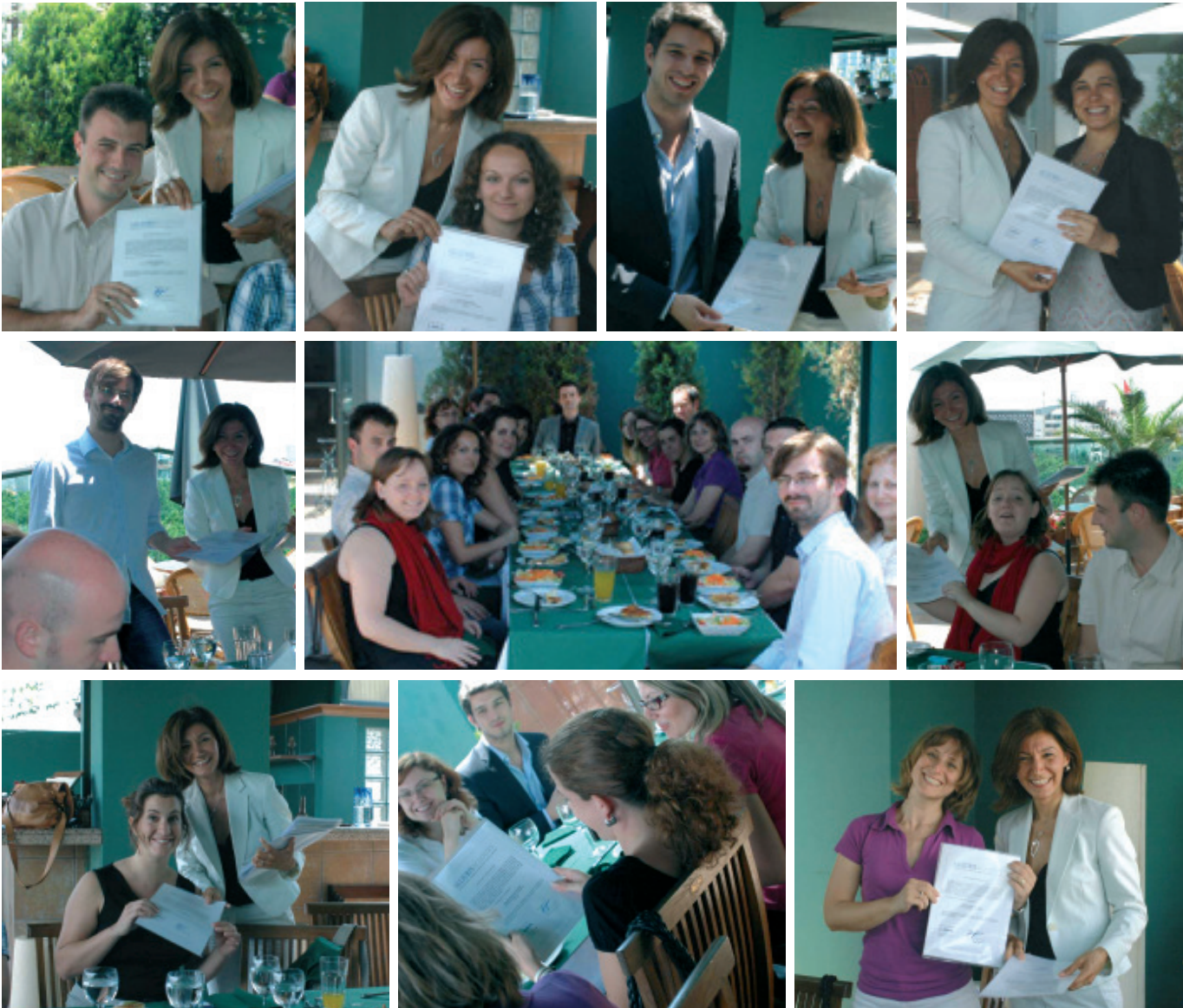
Presentation of the Certificates