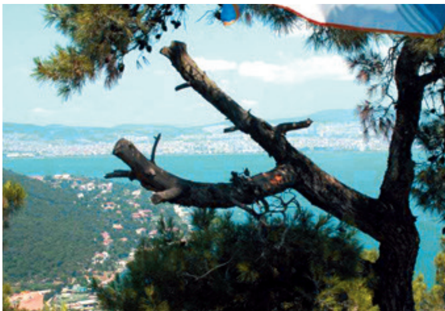
On the top of Büyükada island