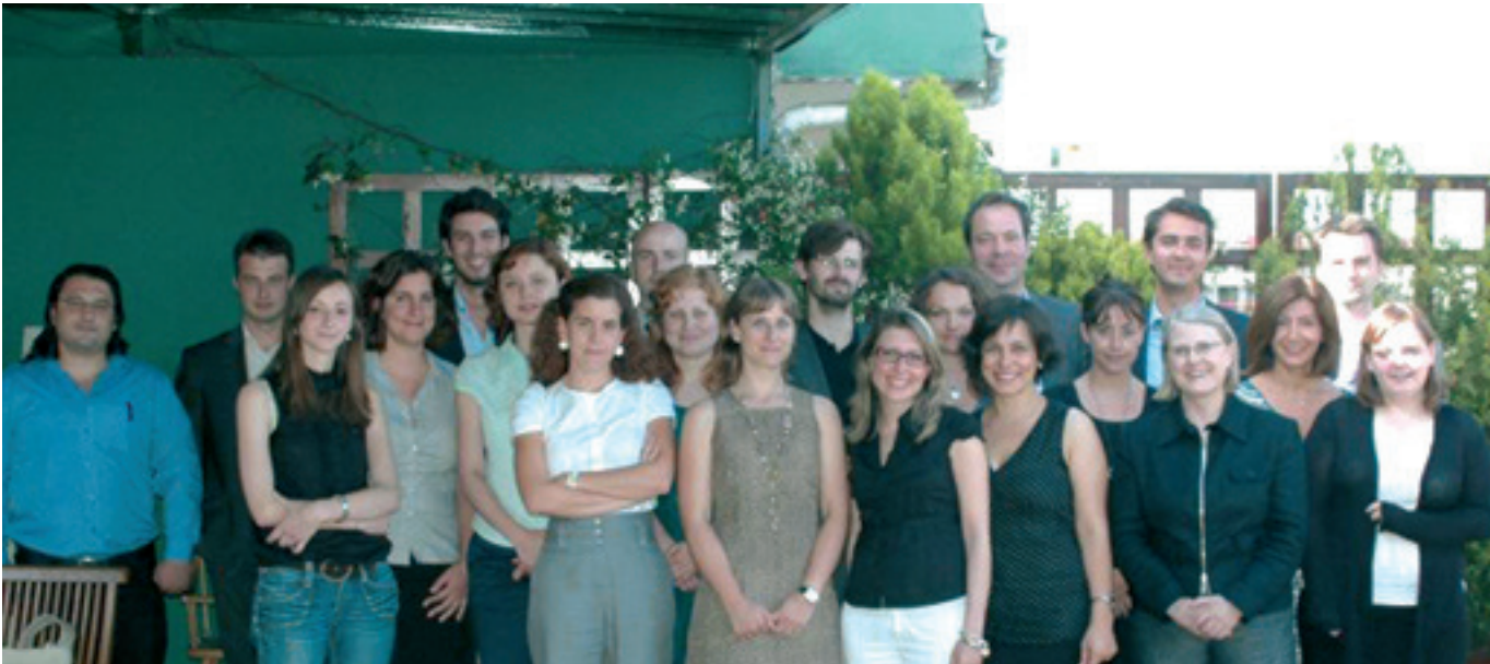
The Group at the Terrace Restaurant of Germir Palas Hotel