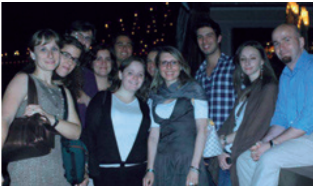
Boat trip on the Bosphorus by night