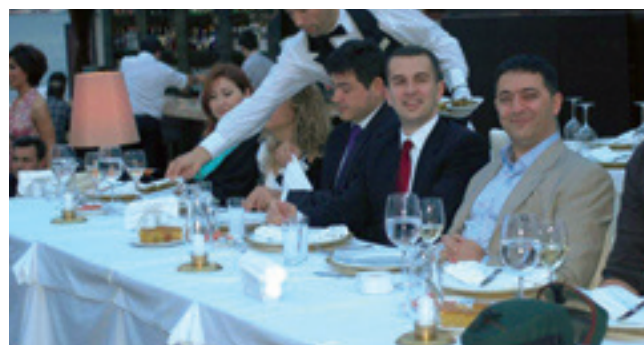
At the restaurant Fishmekan close to the Bosphorus

in the world where you can see a modern western city combined with a traditional eastern city. It is a melting pot of many different people and civilizations. Istanbul was also declared by the European Union as the 2010 European Capital of Culture. Our wonderful hosting guides gave us the opportunity to be part of all. This included having dinner at wonderful places with amazing views of the Bosphorus Strait and visiting great bars in the old town near Taksim Place or famous modern discotheques close to the Bosphorus River.