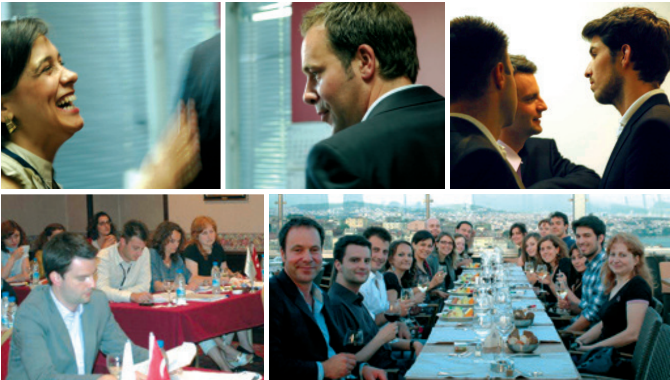
Conference in Gemir Palas Hotel